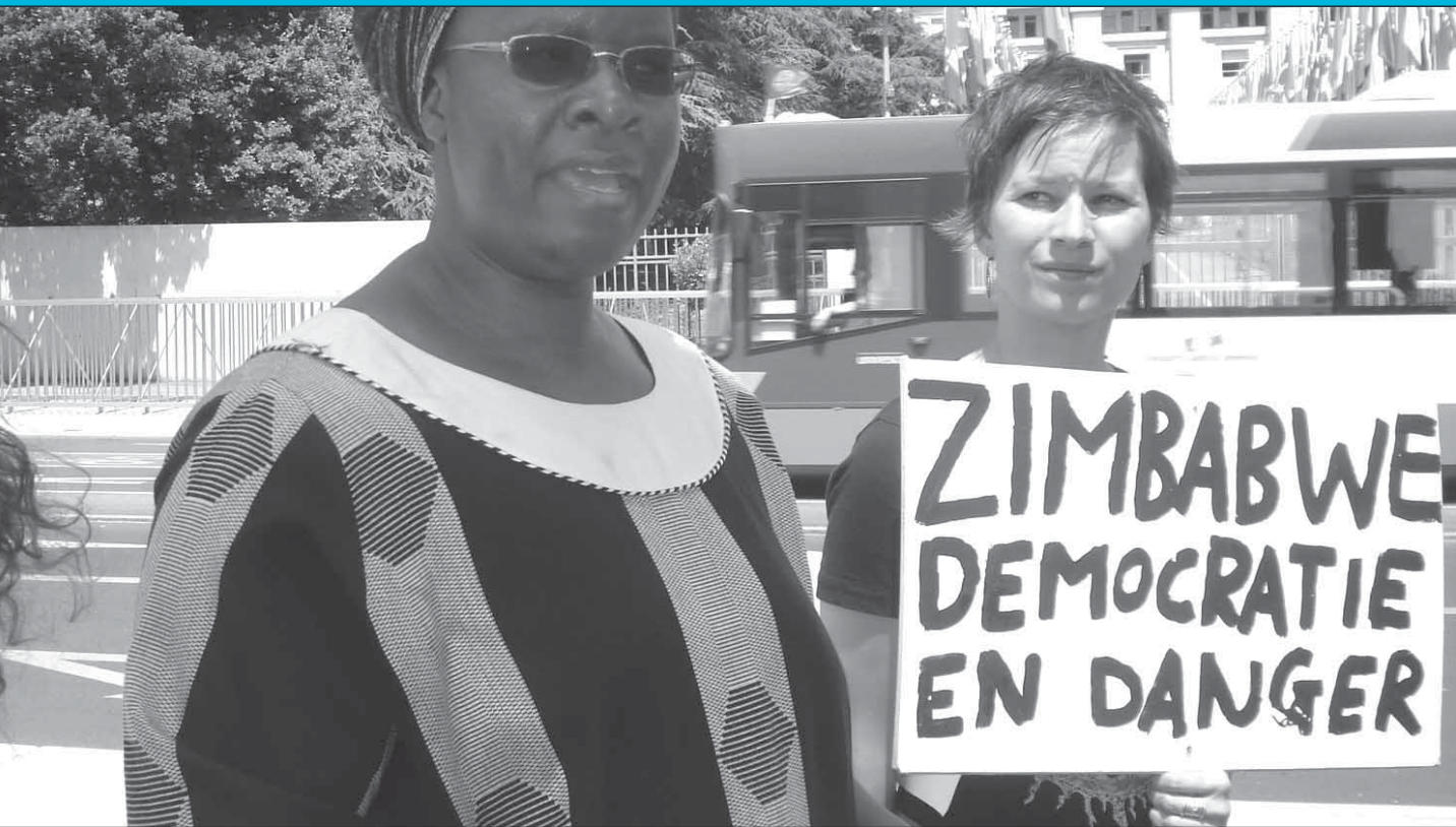
As the political crisis in Zimbabwe deepens, women and girls remain the most affected by the violence and poverty

and holder of the UN mandate on young people and HIV and AIDS, with more than 4,000 youth leaders and adult allies in 150 countries.