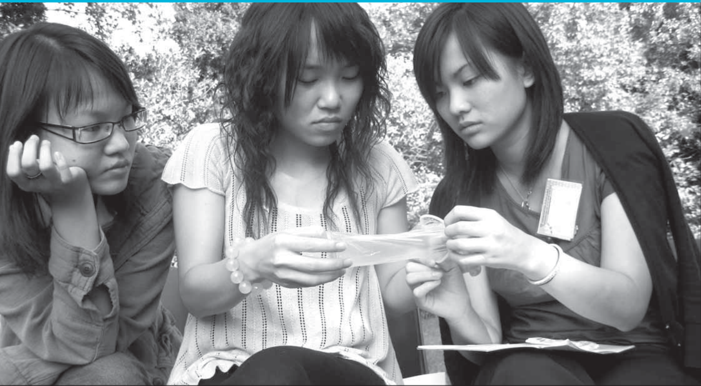
Young women need HIV-prevention knowledge as well as skills to negotiate safe sex.

well as national monitoring and evaluation efforts and specific indicators outlined in the 'Three Ones' 2 agreement