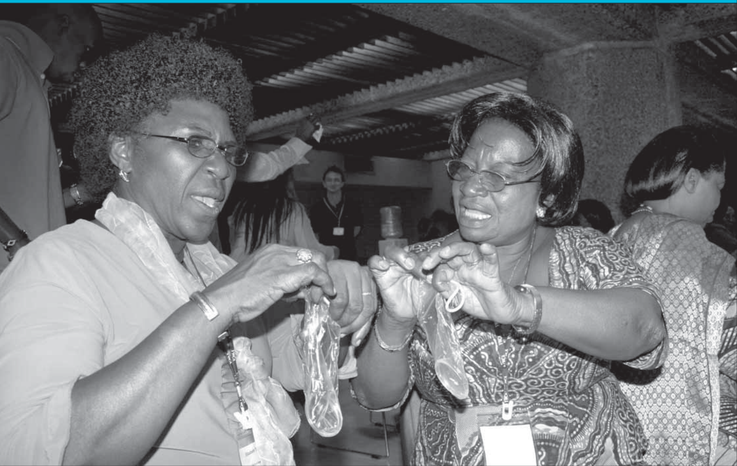
Women at a workshop learn how to correctly use the female condom.