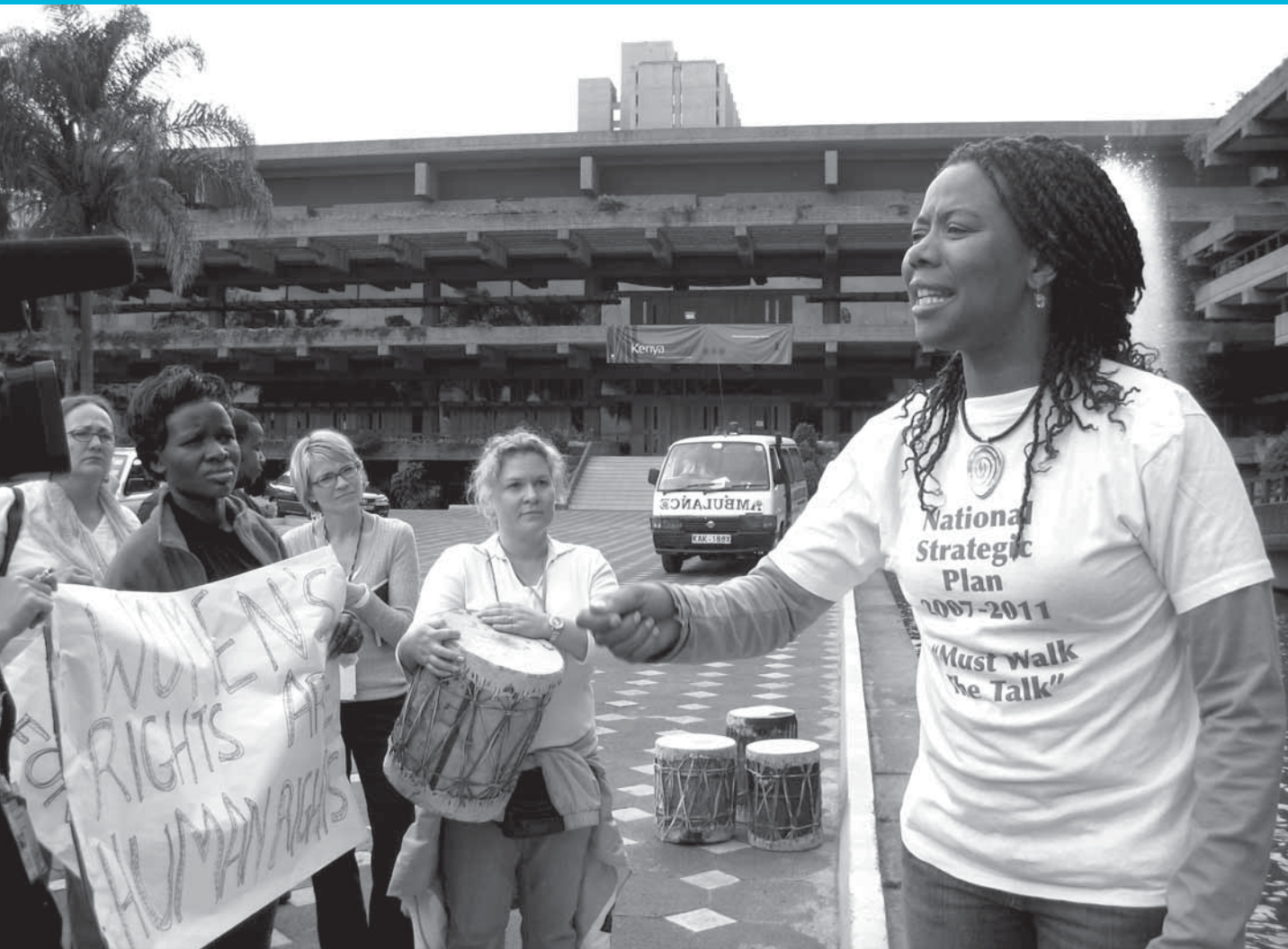
Women participate in a peaceful march during the International Women's Summit on Women's Leadership and HIV and AIDS, Nairobi, Kenya