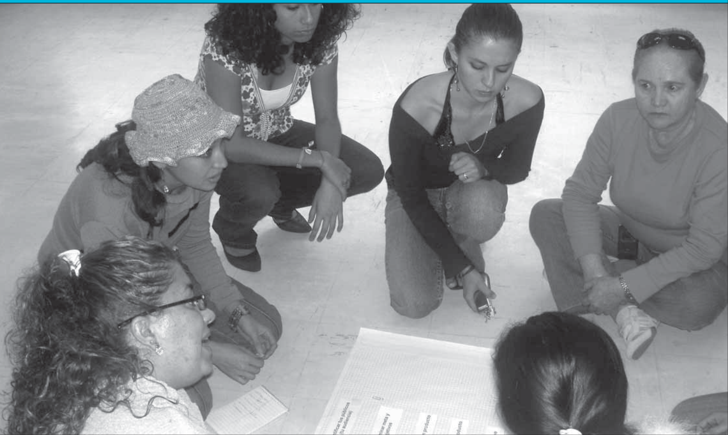
YWCA of Naucalpan, Mexico holds youth friendly workshops to empower young women with HIV prevention skills.