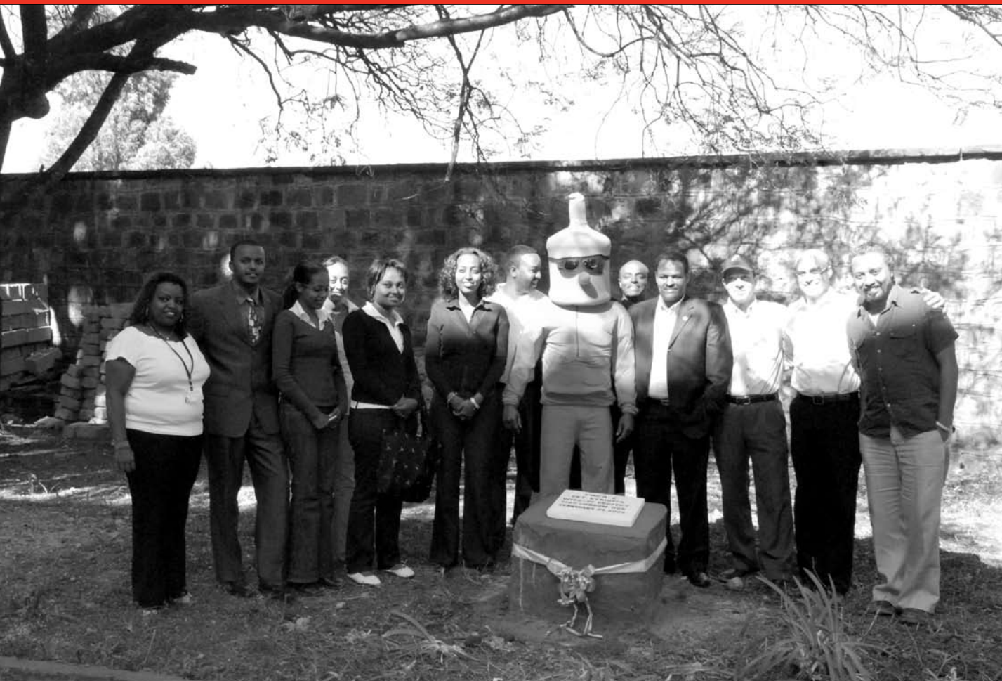
The YWCA of Ethiopia staff and supporters at the launch of the condom kiosk at Addis Ababa University.