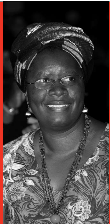
Nyaradzayi Gumbonzvanda General Secretary, World YWCA

While the World YWCA makes its own contributions, the movement continues to ask for accountability and commitment towards actions that invest in women and girls, uphold their human rights and end stigma and discrimination. The International Conference of Population and Development (ICPD) held in Cairo in 1994 concluded with pledges to achieve universal access