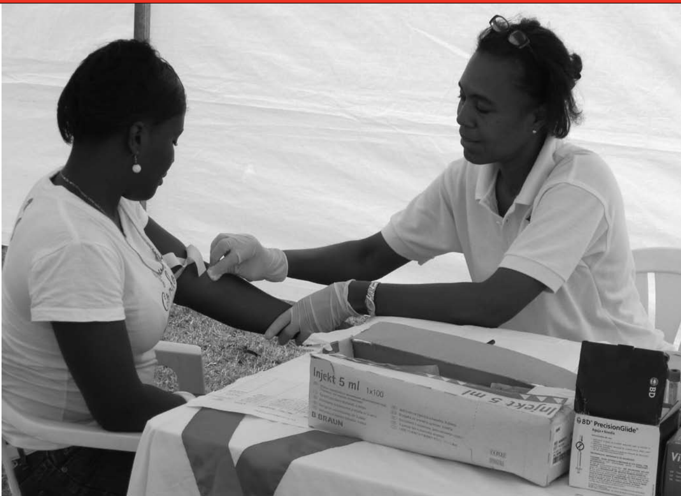
The YWCA of Grenada hosted an HIV awareness booth and voluntary testing at the Grenada Sailing Festival.