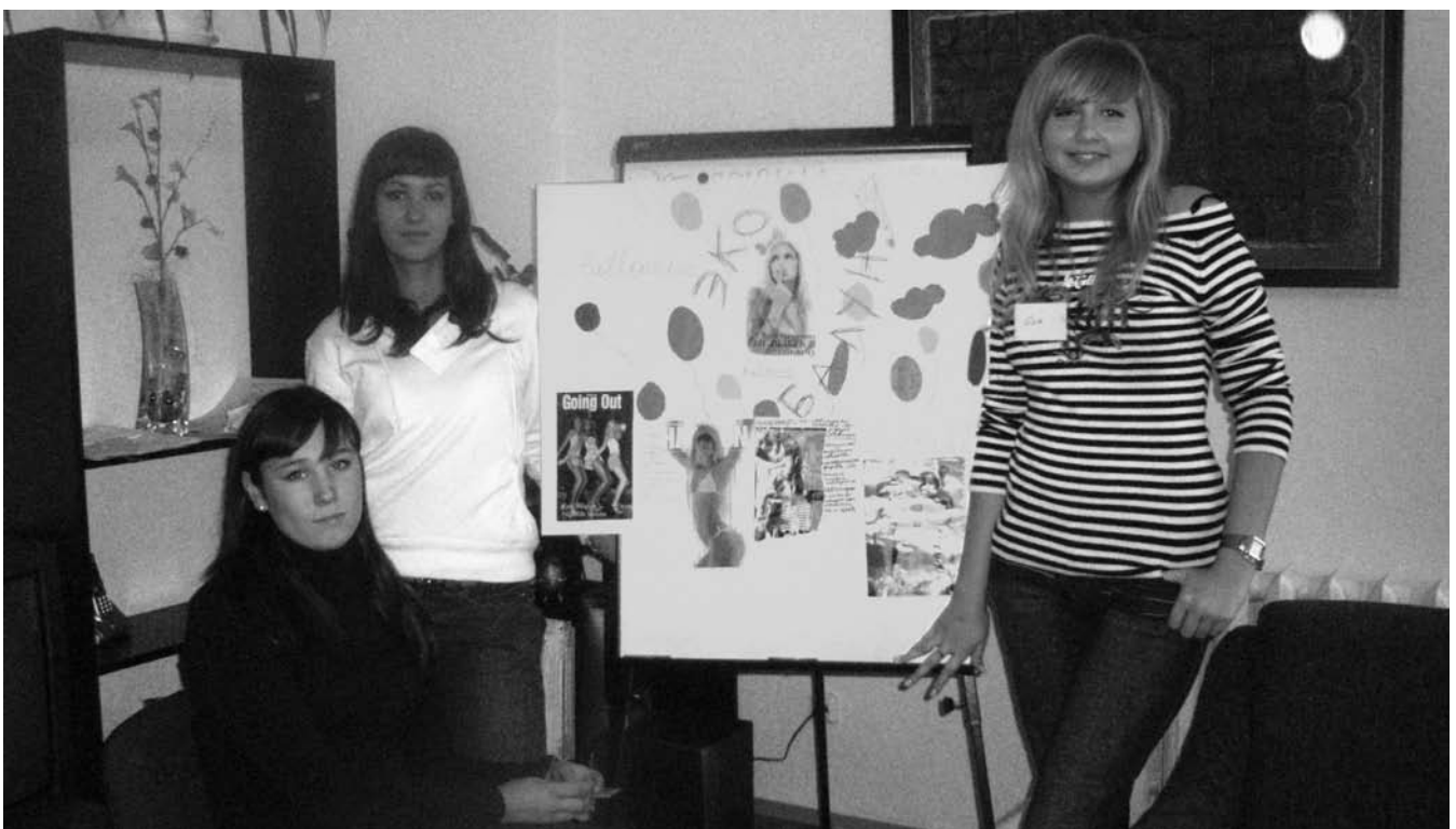
Over 200 young women took an active part in the YWCA of Ukraine trainings on sexual and reproductive health and rights.

Since 1855, YWCAs around the world have championed women's rights. YWCAs work within their local context to find solutions that work for the women and girls in their community. In this briefing, we highlight the work YWCAs are doing to ensure women's sexual and reproductive health and rights.